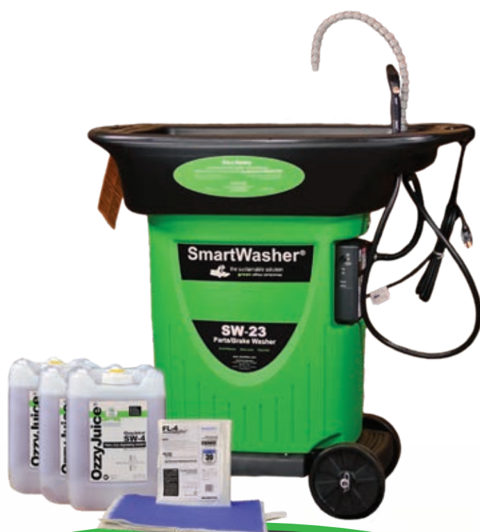
Code 14740 SW-23 Model Mobile Parts Washer Kit

(1x SW23 unit +3 Pails SW4 Fluid + 1x FL 4 Filter)