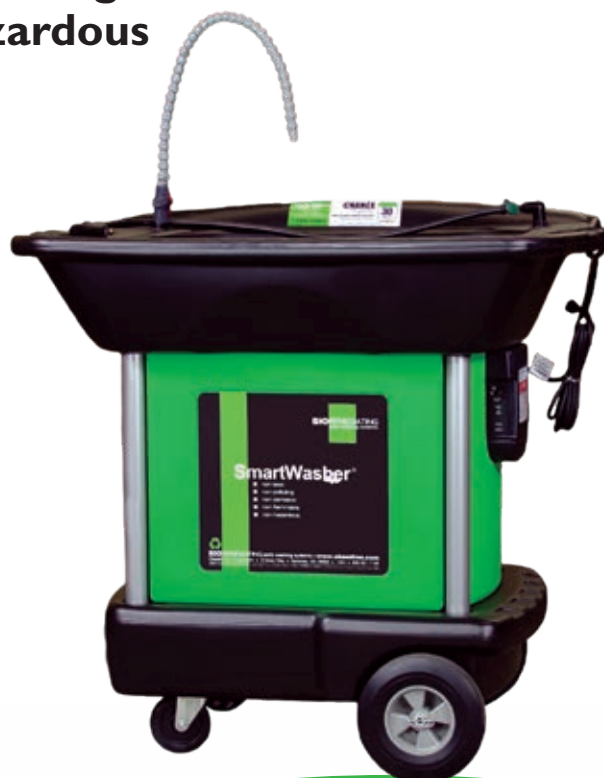
Code 14741 SW-437 Model Mobile Heavy Weight Parts Washer Kit

(1x SW23 unit +3 Pails SW4 Fluid + 1x FL 4 Filter)